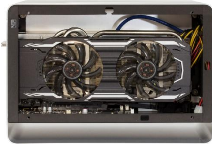
* Graphics card sold separately